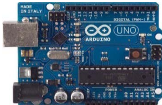
Fig-2: Arduino UNO

Fig2. Shows the Arduino UNO board. It is basically a micro-controller kit that issued to get data from peripheral devices (sensors, motors, etc.). The Arduino UNO Micro-controller board is based on the AT mega328PIC. The AT mega328P is good platform for robotics application which makes robot to extinguish fire in real time. Arduino UNO board consist the sets of digital and analog pins that may act as an interface to various expansion boards and other circuits. It contains everything needed to support the microcontroller.