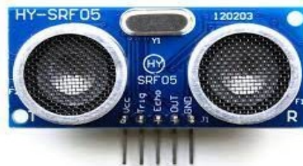
Fig-5: Ultrasonic sensor

An ultrasonic sensor is an electronic device that measures the distance of an object by emitting ultrasonic sound waves, and converts the reflected sound into an electrical signal. Ultrasonic waves travel faster than the speed of audible sound (i.e. the sound that humans can hear). Ultrasonic sensors have two main components: the transmitter (which emits the sound using piezoelectric crystals) and the receiver (which encounters the sound after it has traveled to and from the target).