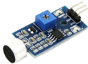
Fig-4: Sound sensor

A Sound sensor is defined as a module that detects sound waves through its intensity and converting into electrical signals. Generally, this module is used to detect the intensity of sound. This application of this module mainly includes switch, security.