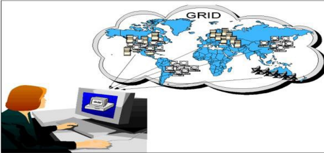
Fig 2: Grid Computing Concept

Here Fig. 2 shows the general concept of grid computing which shows that various resources are segregated from across the globe or geographically dispersed locations towards a central location i.e. the grid system.