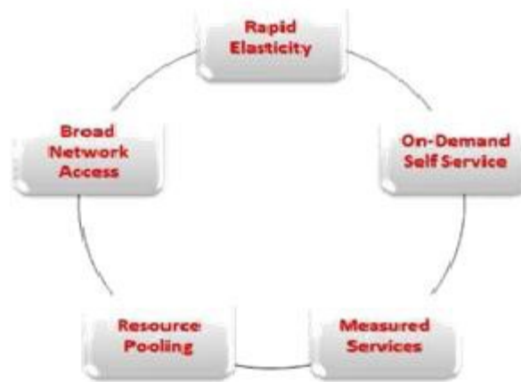
Fig 4:Five features of cloud Computing

Cloud has five essential features such as rapid elasticity, measured services, on-demand self-service, resource pooling, and board network access as shown in Fig. 4.